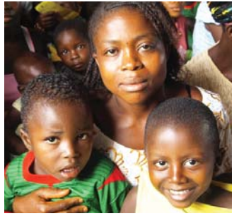
Children remain the primary focus for HCW programs.

Task forces have been formed to focus on each of the programs in Sierra Leone and develop a comprehensive plan for achieving these visions. The CRC and Mercy task forces have been diligently working to develop these plans by conducting research, consulting with specialists and identifying potential partners.