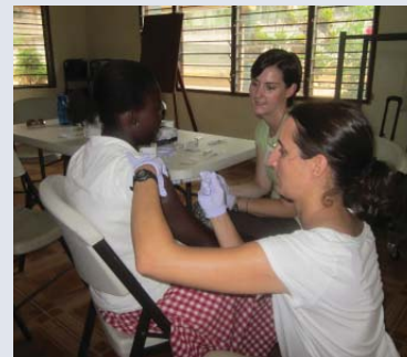
Right: Volunteers administer polio and MMR vaccine to the Child Rescue Centre residents.

Helping Children Worldwide would like to thank the Jack DeLoss Taylor Charitable Trust for their continued support for the Child Rescue Centre. This month we were able to provide two essential childhood vaccines, polio and MMR, to the CRC residents and those students attending University and Technical Vocational school. Thank you for helping us keep the CRC children healthy.