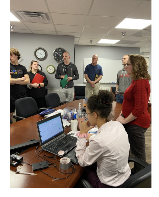
March 2022 Team - a Journey to Mercy