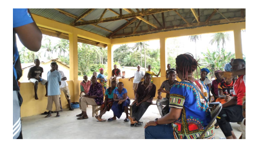
Ways to use improvements in Village Infrastructures to...