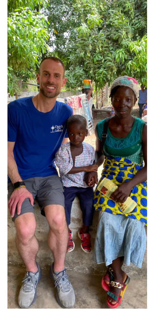
"Borne of God"